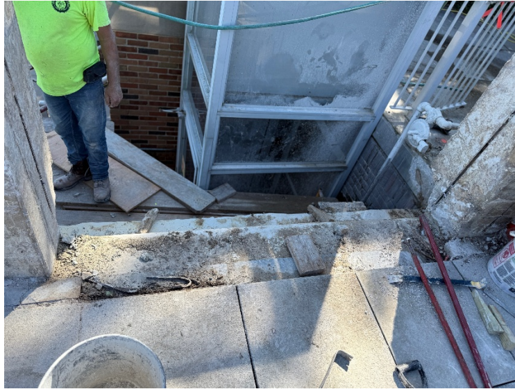
Figure 5: View of masonry removed to allow the removal of the existing lift.