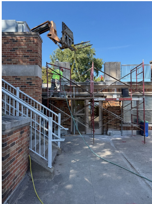
Figure 4: Photo of Masonry demolition being done to salvage brick to be reused on site.