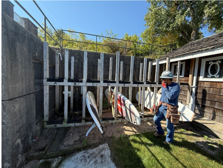
Figure 7: Removal of racks to allow demolition to occur.