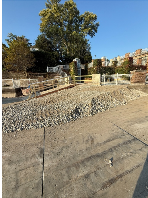
Figure 9: New temporary ramp for heavy machinery.