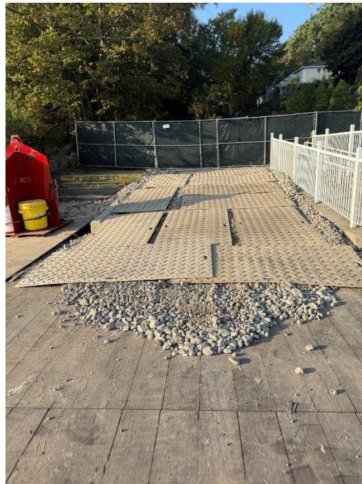
Figure 10: Placement of mats to keep ramp stone in place.