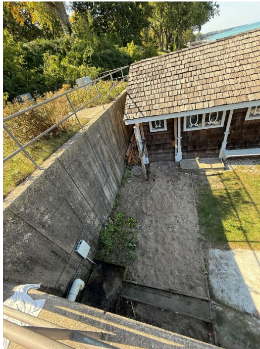
Figure 8: View of area with racks removed.