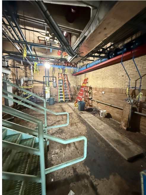
Figure 3: View of mechanical room facing west.