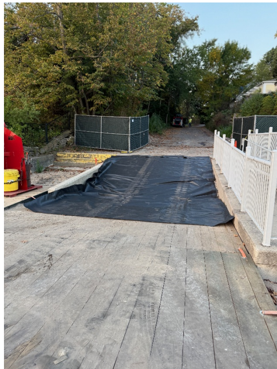
Figure 6: View of material put over stone to accommodate heavier machinery accessing the ramp area on the beach.