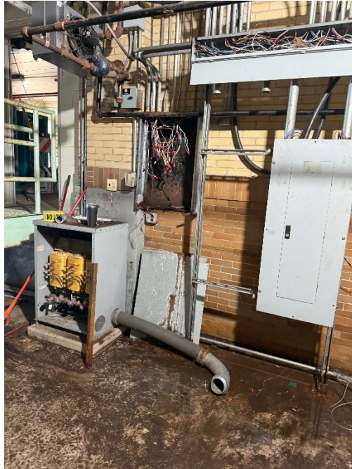
Figure 1: Removal of electrical equipment within main building.