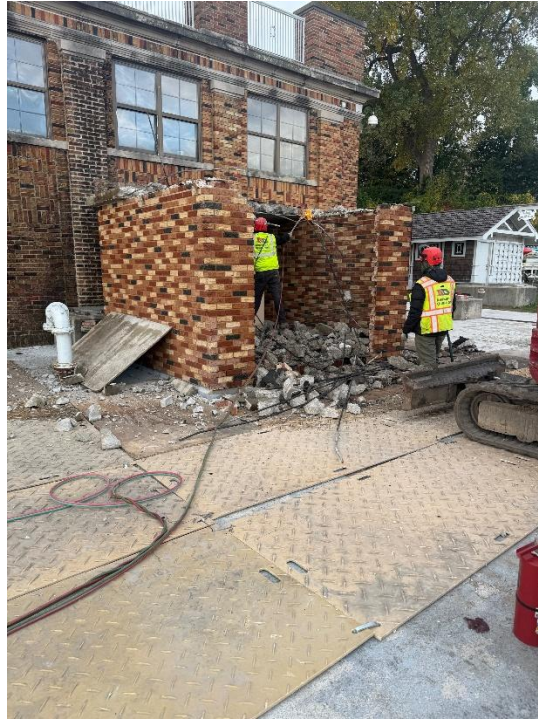
Figure 1: Continued to remove eastern brick structure.