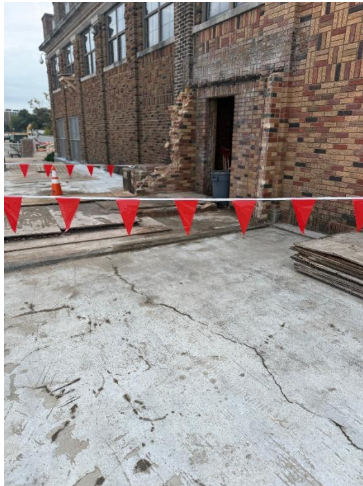
Figure 2: Finishing demolition of eastern structure.