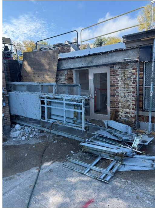
Figure 3: Removal of ADA lift.