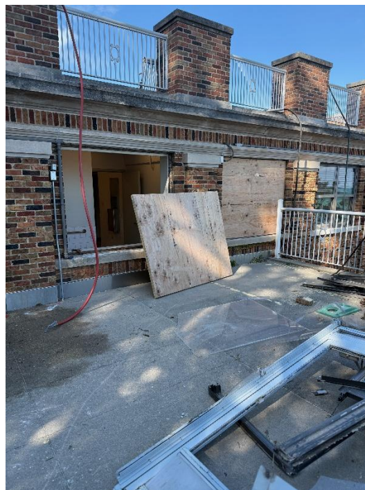
Figure 4: Removal of windows scheduled on south side of the building.