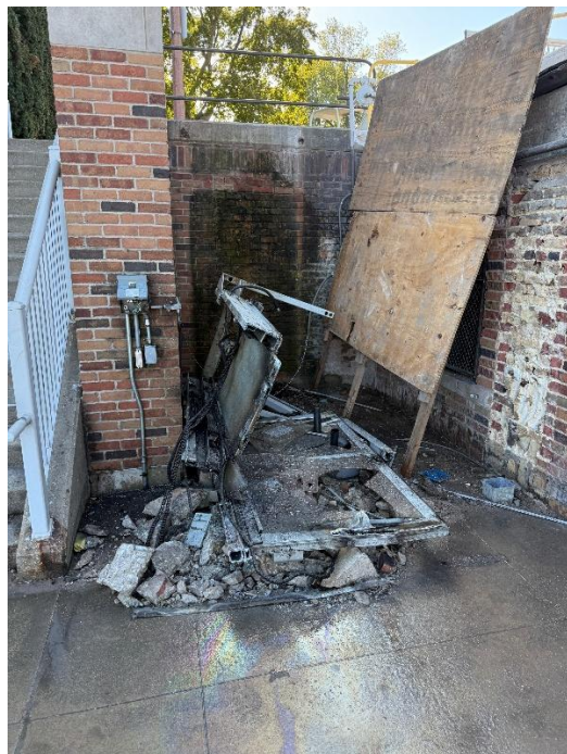
Figure 6: Demolition ADA lift and associated electrical connections.