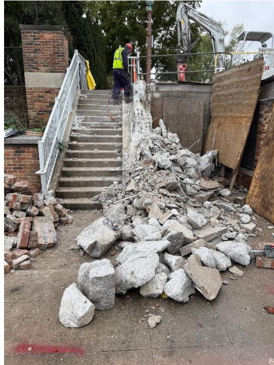
Figure 7: Removal of concrete steps.