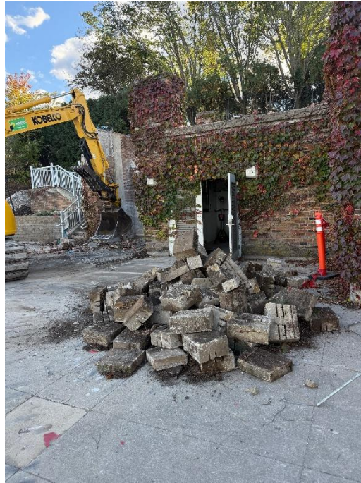
Figure 3: Removal of lower deck pavers to be saved cleaned and reused.