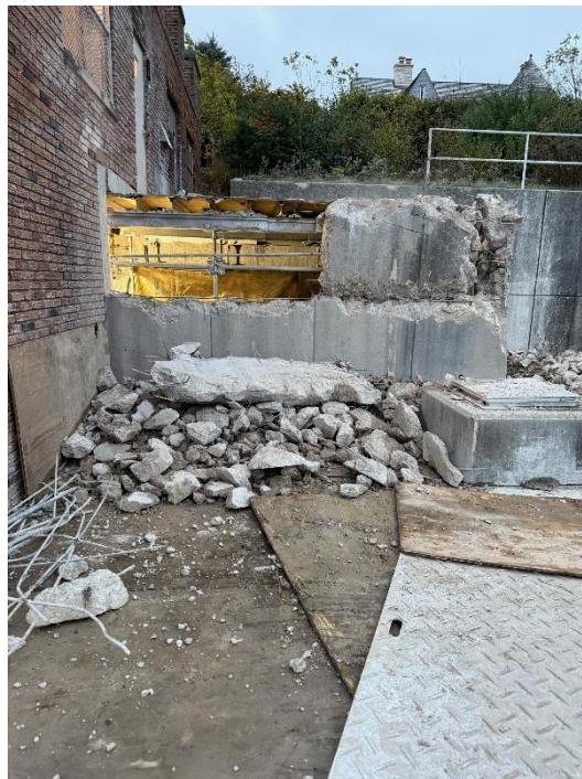
Figure 2: Initial steps to remove concrete structure on north side of the building.