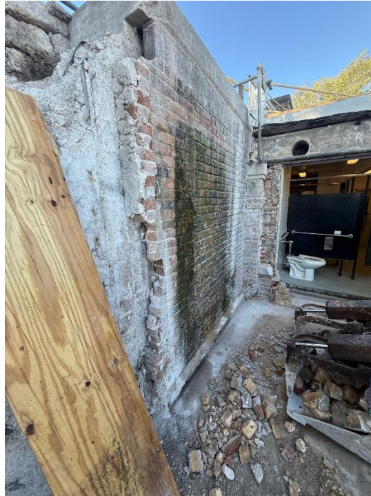
Figure 1: Removal of exterior wall on south side of building.