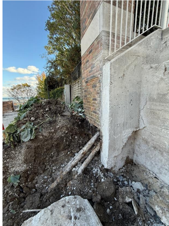
Figure 7: Removal of concrete steps.