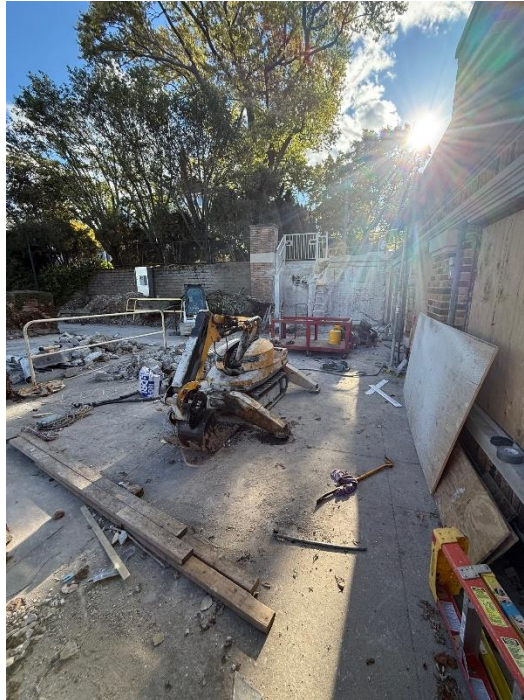
Figure 5: Removal of concrete wall next to former ADA lift location.