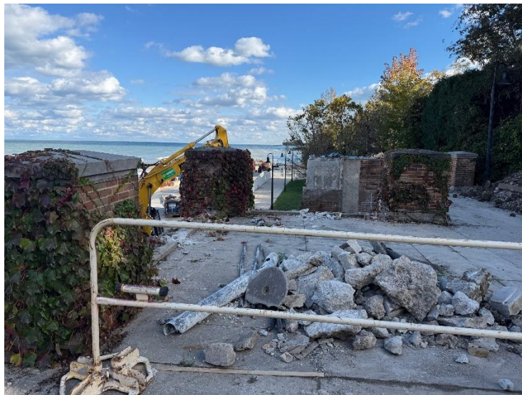
Figure 8: View of demo from lower deck.