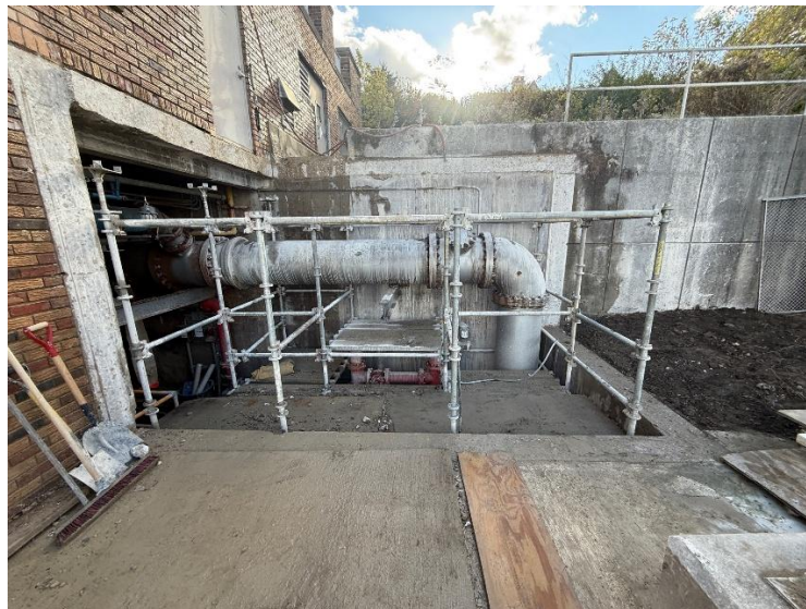
Figure 4: Complete removal of Concrete structure on the north side of the site.