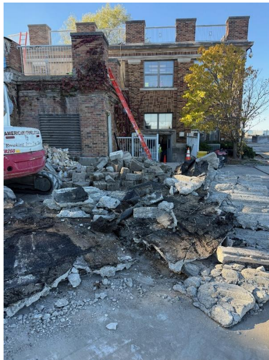
Figure 2: Removal of material debris.