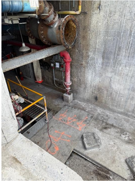
Figure 7: Demolition of interior piping to make way for new entrance.