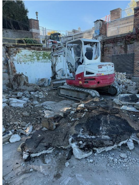
Figure 3: Heavy machinery to break up concrete foundation.