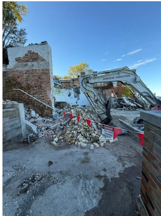
Figure 6: Demolition of southern building.