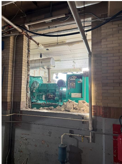
Figure 8: View of demolition from inside water plant.