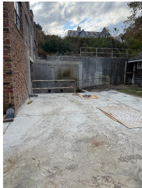
Figure 4: Complete removal of piping inside concrete structure on the north side of the site.