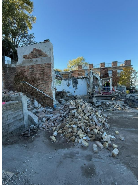
Figure 1: Removal of exterior building on south side of site.