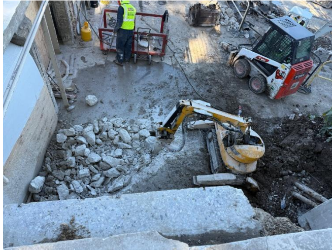
Figure 5: Removal of concrete next to former ADA lift location.