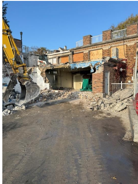
Figure 10: View of demolition from the east side of the lower deck.