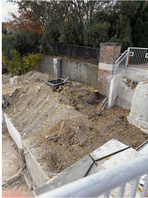
Figure 5: Area being prepared for helical piers to be installed the week of 11/10.