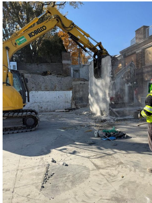
Figure 2: Concrete deck removed by the demolition contractor.