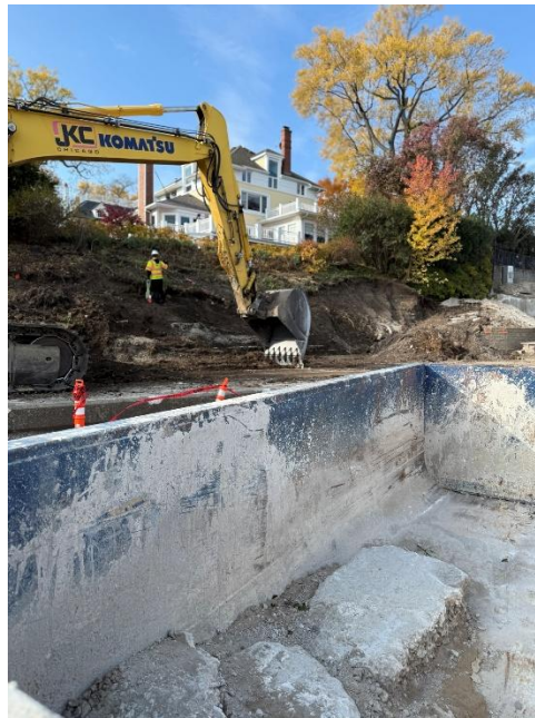
Figure 4: Excavation of the southern area in front of the bluff.