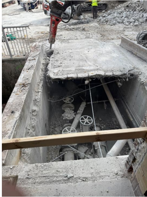
Figure 7: Demolition of area south of building for new foundation of bathroom building.