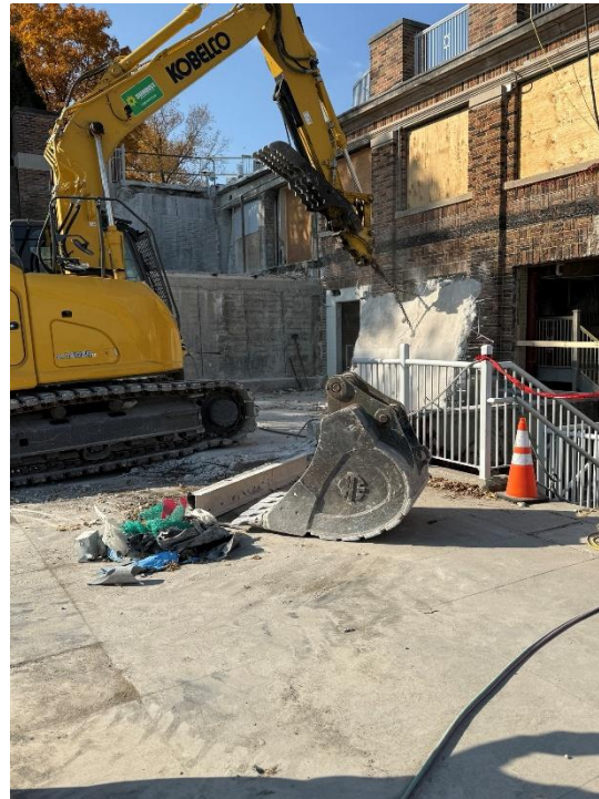
Figure 1: Demolition continues.