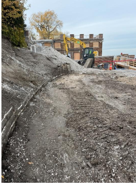
Figure 9: Demolition of area on the south portion of the site facing north.