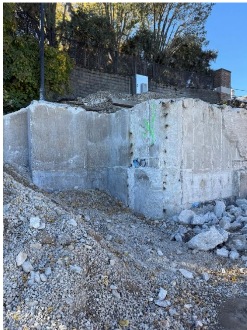
Figure 6: Demolition of southern area to make way for new ramp.