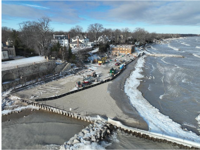
Figure 1: Aerial view of the site facing north.