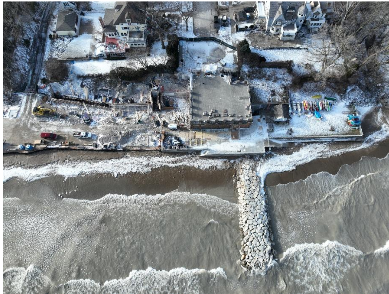
Figure 2: Aerial view of the site facing west.