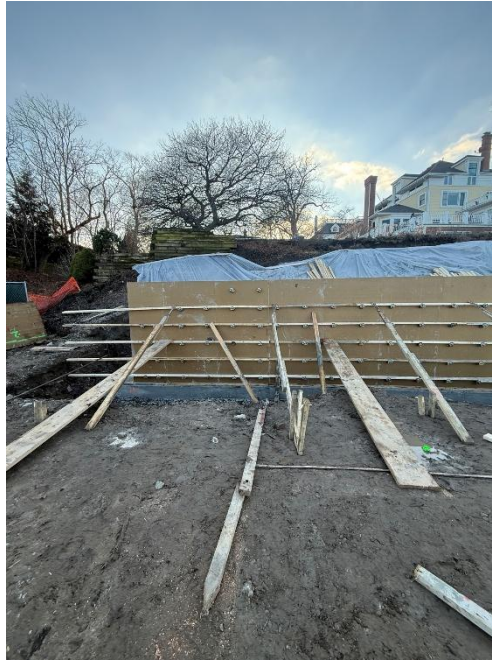
Figure 5: Foundation wall framing being installed.