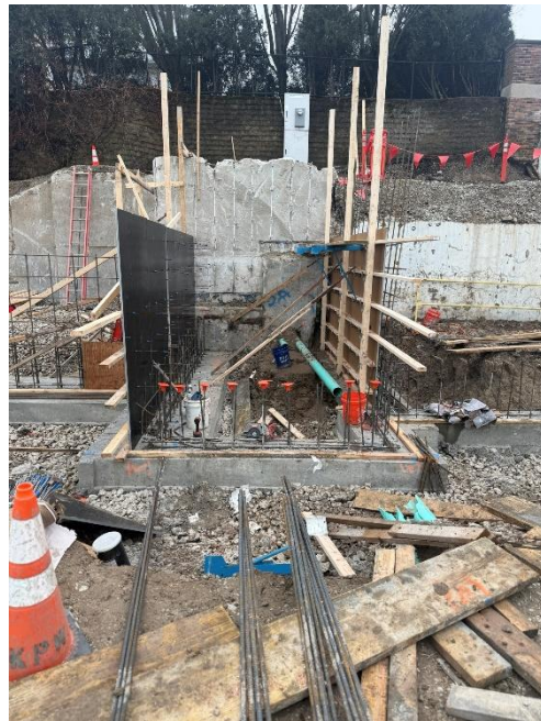
Figure 8: Addition view of forms for new stairs being installed.