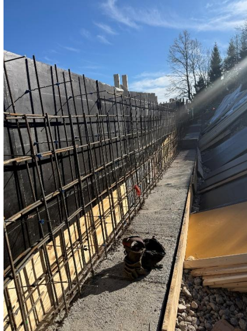
Figure 7: Additional view of rebar in concrete forms.