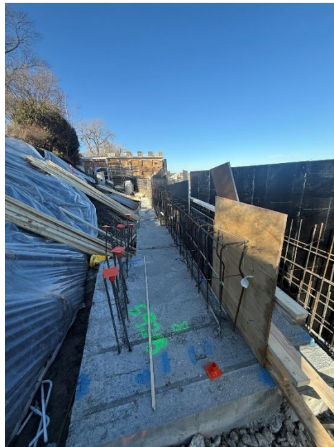
Figure 4: Framing and foundations being prepared for concrete pour.