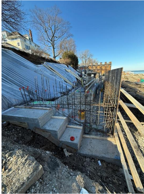
Figure 3: Framing for the foundation walls on the south end of the site.