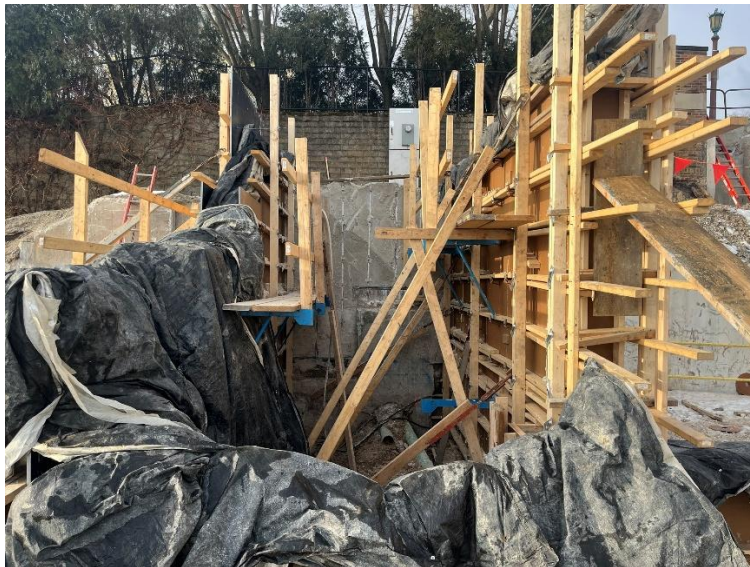
Figure 6: View of stairway walls poured and blanketed.