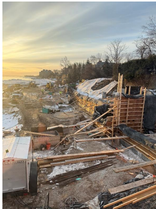
Figure 4: View of concrete forms blanketed to protect form the wind and the cold.