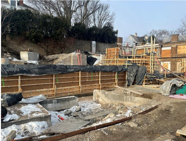
Figure 5: Blanketed concrete forms on the south end of the site.