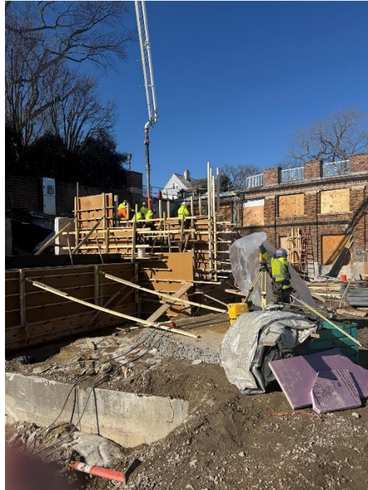
Figure 3: Concrete pump truck delivering concrete to the new stair well.