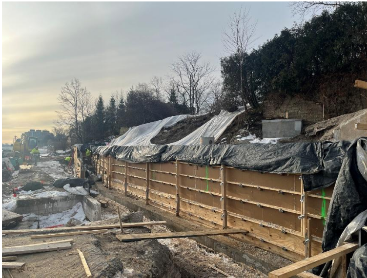
Figure 8: Addition view of blanketed concrete forms.