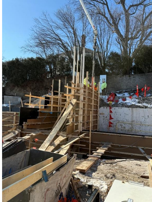
Figure 1: Pumping the concrete into the concrete forms.