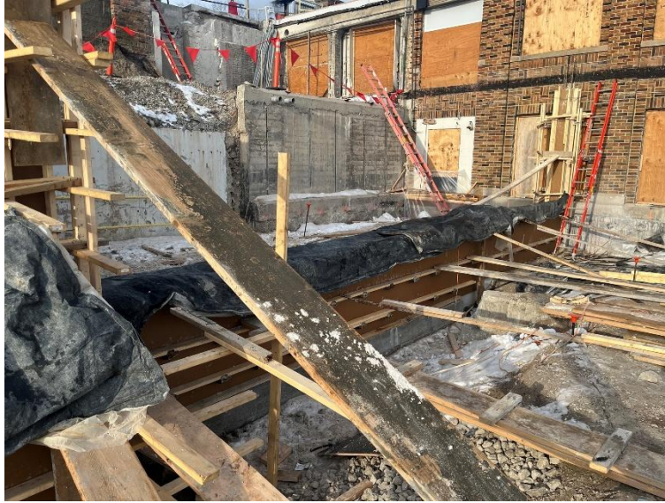
Figure 7: Poured and blanketed concrete foundation on the south side of the site building.