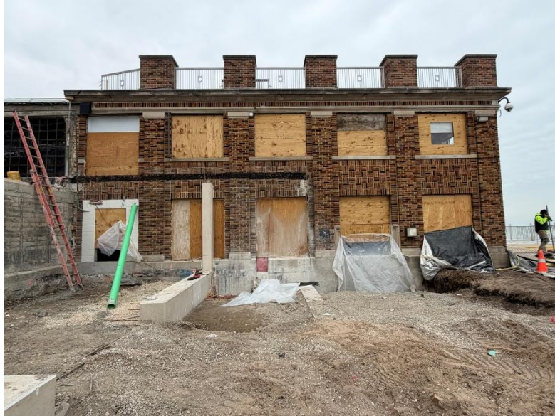
Figure 1: Building area being prepared for installation of steel beams.