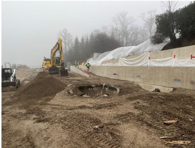
Figure 5: New ramp and backfilling activities.