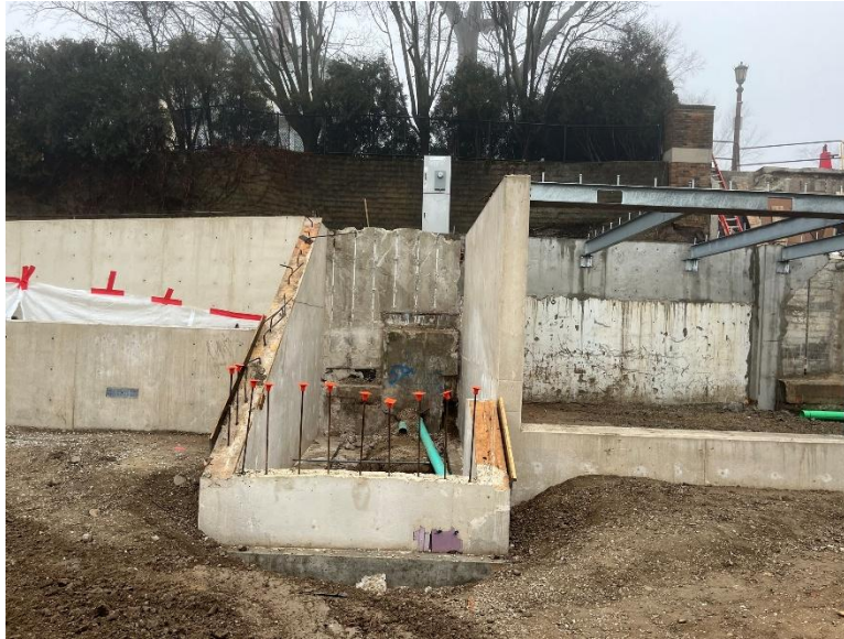
Figure 3: Additional picture of steel installed for the bathroom building.