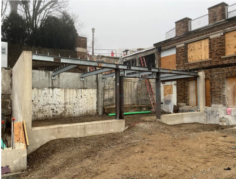
Figure 2: Steel framing installed in the new Bathroom building.