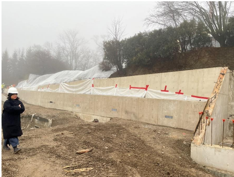
Figure 4: View of concrete ramp walls.