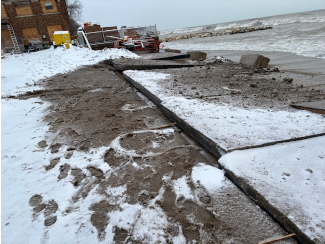
Figure 5: Damaged Site Matting.