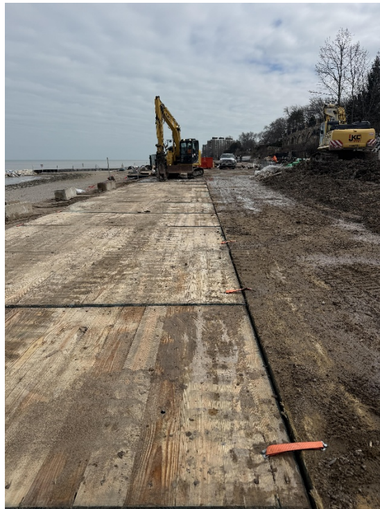
Figure 6: Repaired Site Matting.