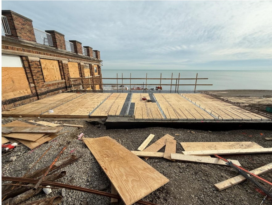
Figure 3: Roof Framing of Bathroom Building.