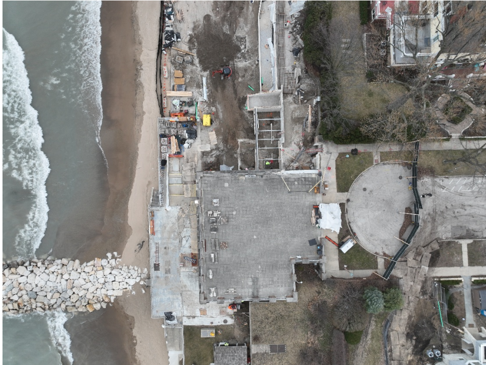
Figure 7: Overhead site photos.