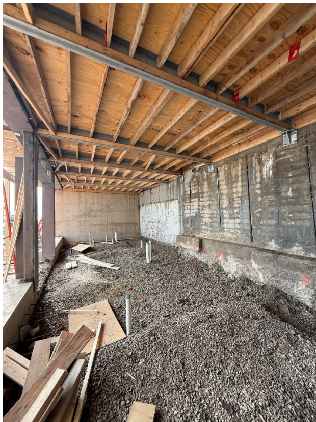
Figure 4: Roof Framing of Bathroom Building.