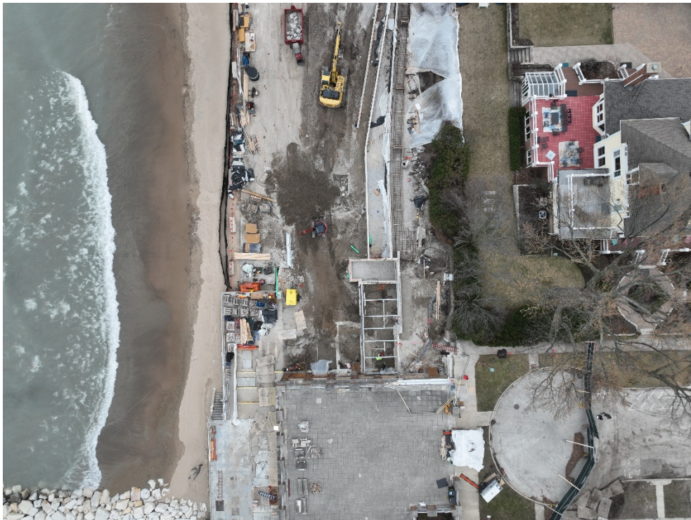
Figure 8: Overhead site photos.