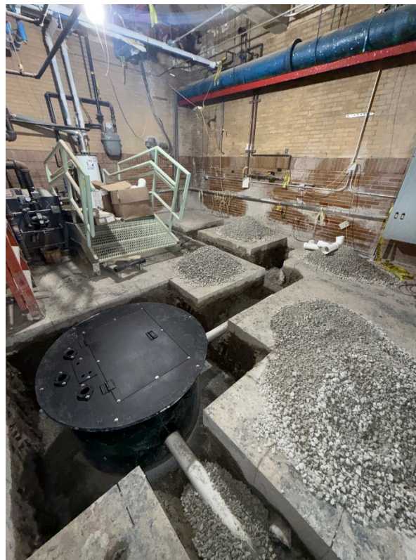
Figure 2: Sewage Ejector Pit and Saw cutting.