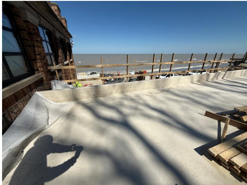
Figure 8: Concrete roof above bathroom building.