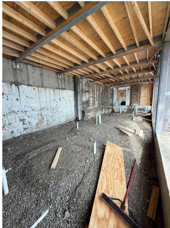
Figure 2: Inside the new bathroom building from another view.