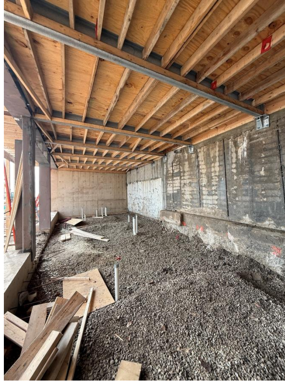
Figure 1: Inside the new bathroom building.