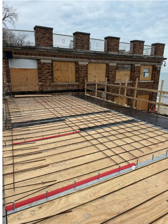
Figure 7: Roof above bathroom building.