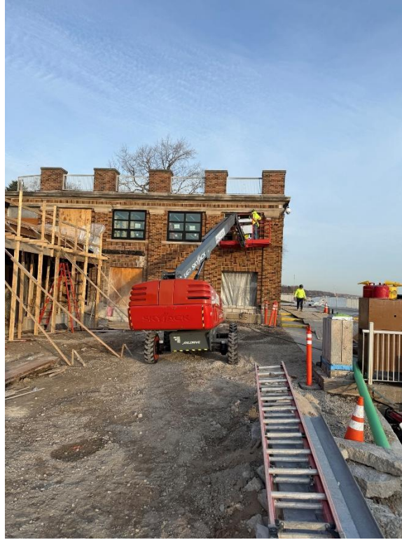
Figure 9: Windows being installed.