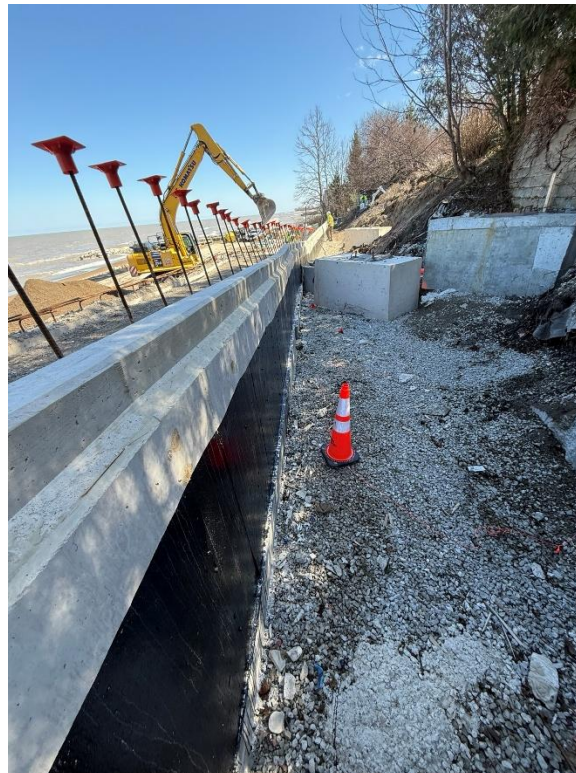
Figure 6: Ramp wall and foundations.