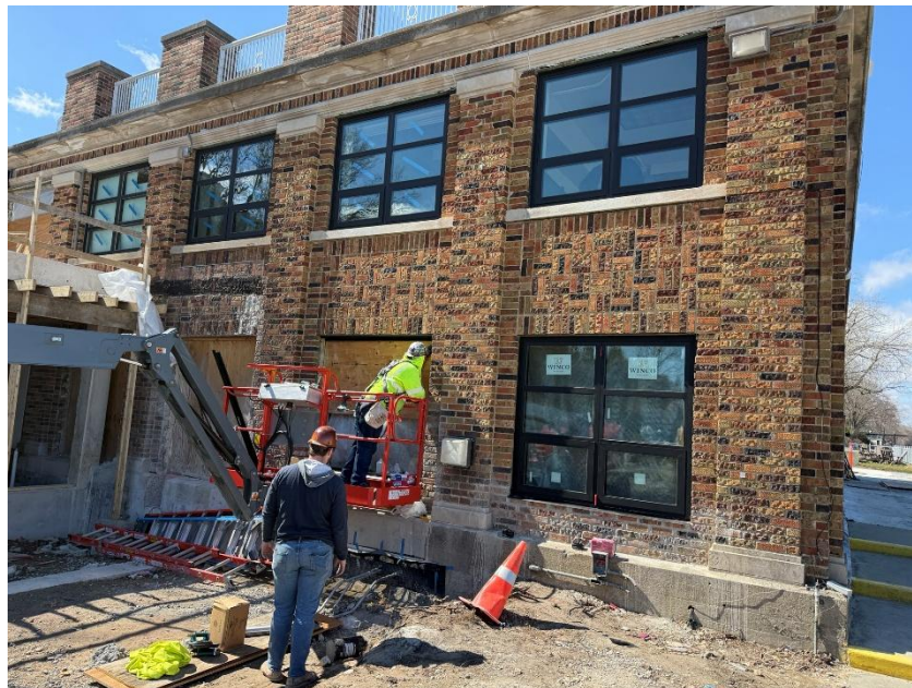
Figure 10: New windows installed.