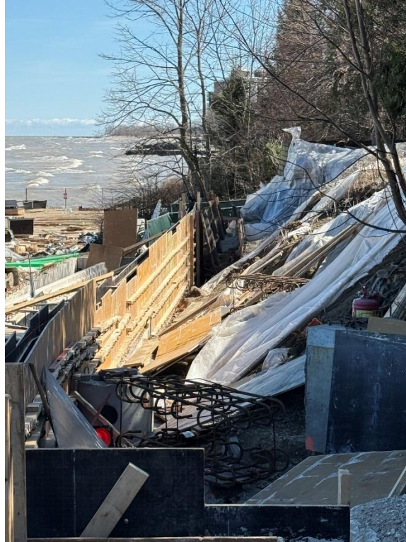
Figure 5: Additional framing for concrete.