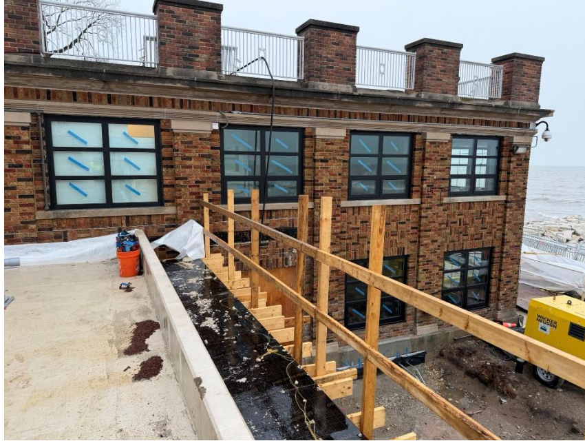
Figure 1: Curb installed on roof top deck.