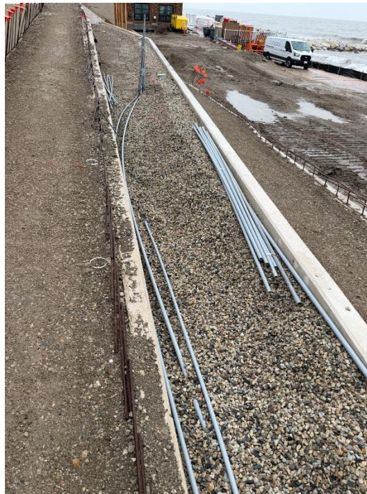
Figure 4: Back fill for the concrete ramp.