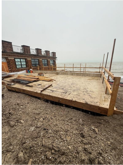
Figure 3: the roof deck of the bathroom building looking east.