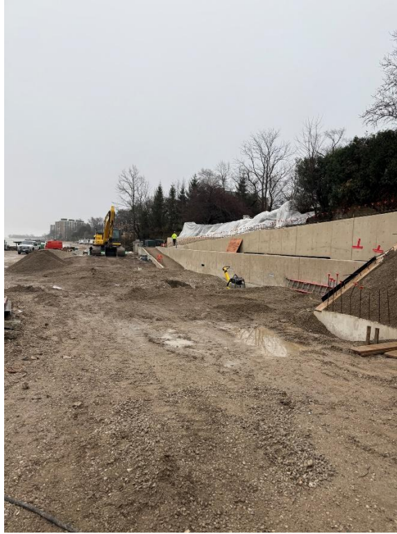
Figure 7: View of the bottom of the ramp facing south.