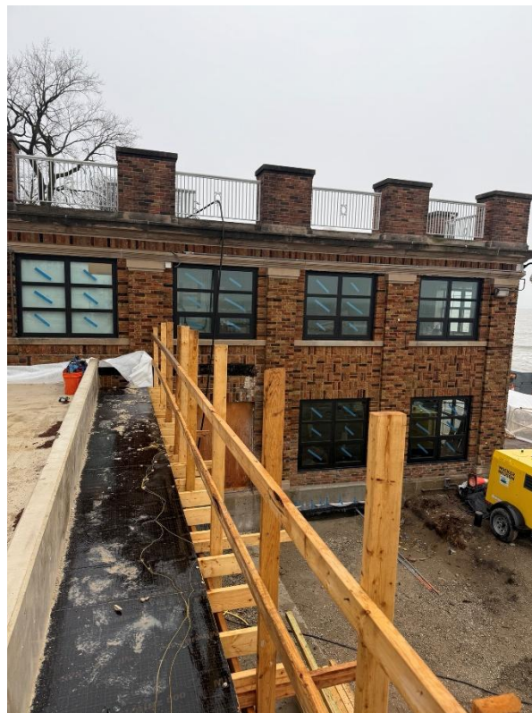
Figure 2: Additional view of the roof top and new windows installed.