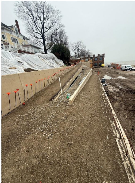
Figure 6: Preparing the ramp for concrete walkway.